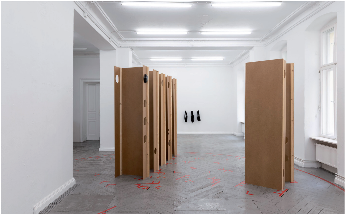
Exhibition view: Lena Grossmann, X ways through organised space , 2021