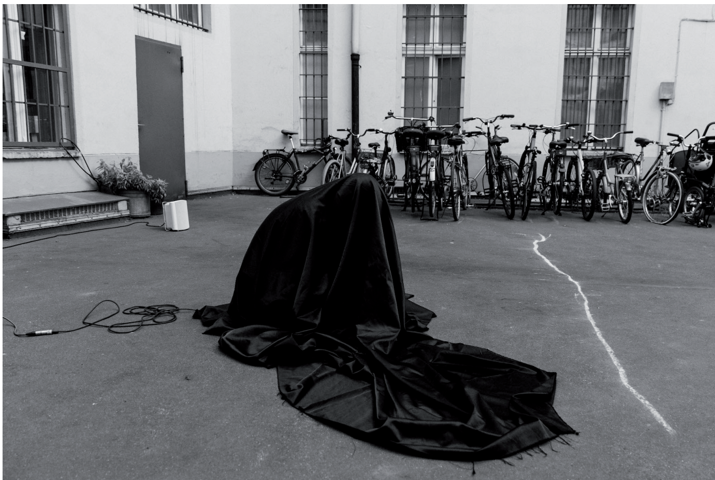
Performance, Selin Wutzler, 2021