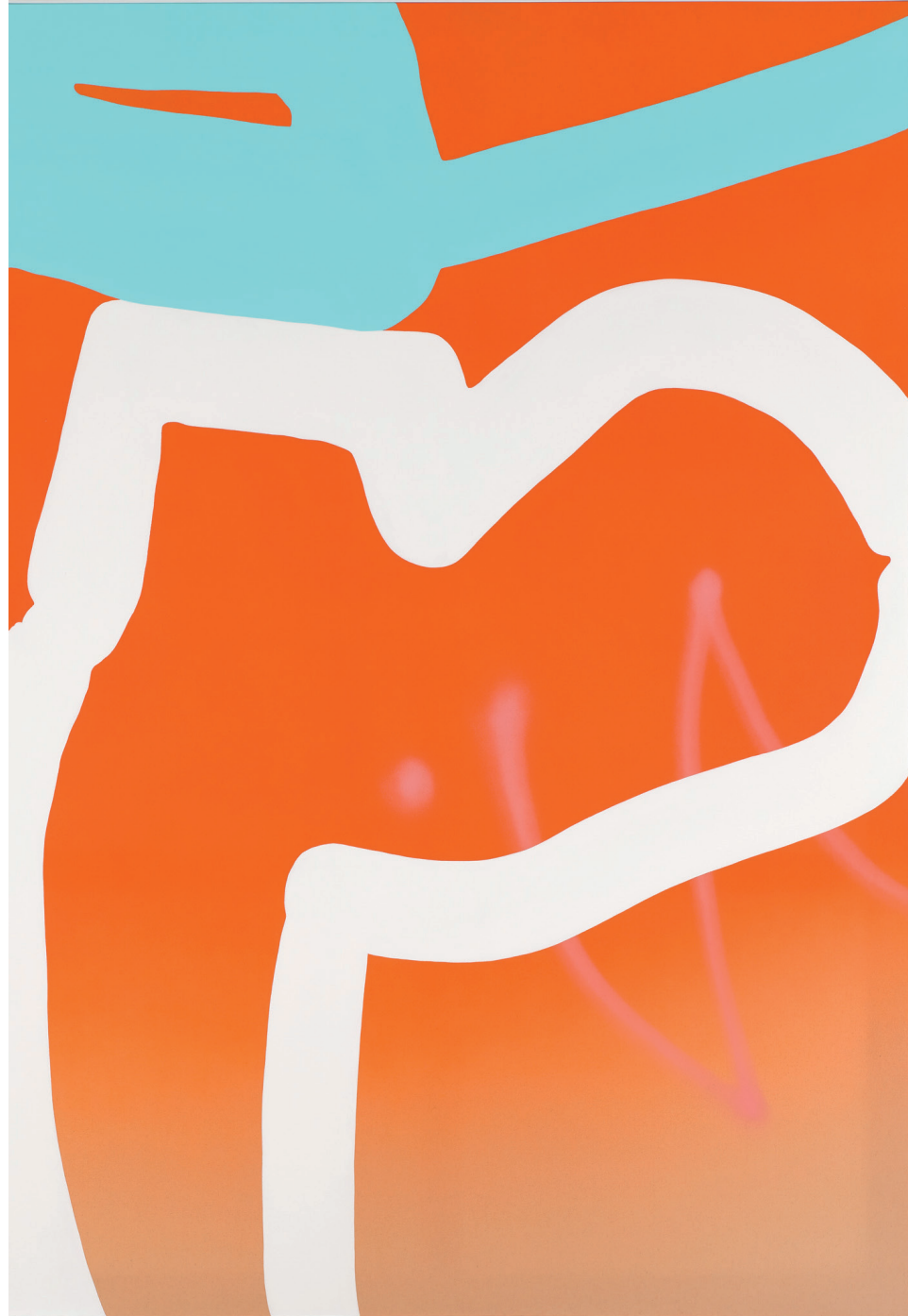
Cornelia Baltes Jag, 2021 Acrylic on canvas 210 x 150 cm