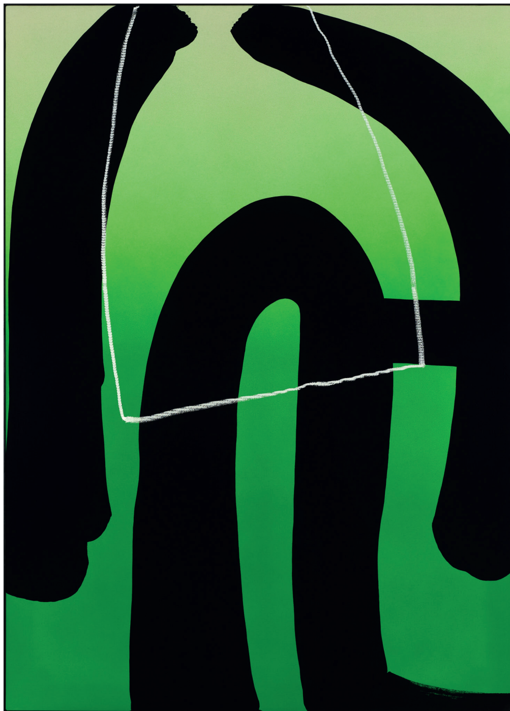
Cornelia Baltes Ko Au, 2021 Acrylic on canvas 180 x 130 cm