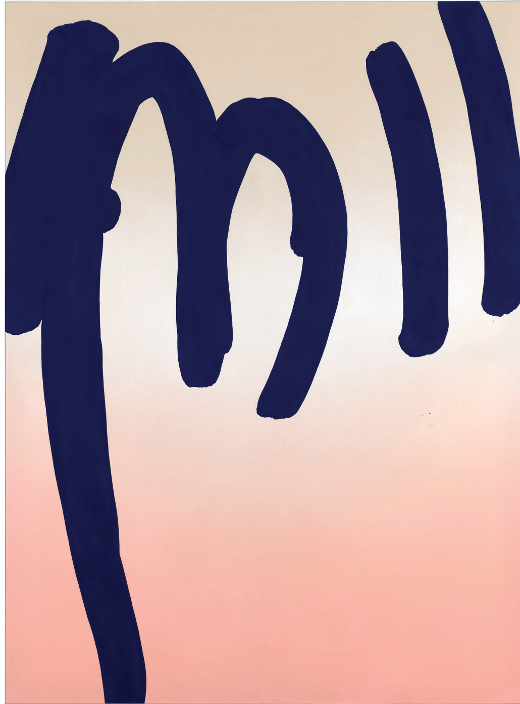
Cornelia Baltes Jeg, 2021 Acrylic on canvas 230 x 170 cm