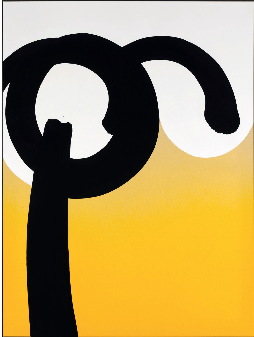
Cornelia Baltes Ako, 2021 Acrylic on canvas 160 x 120 cm