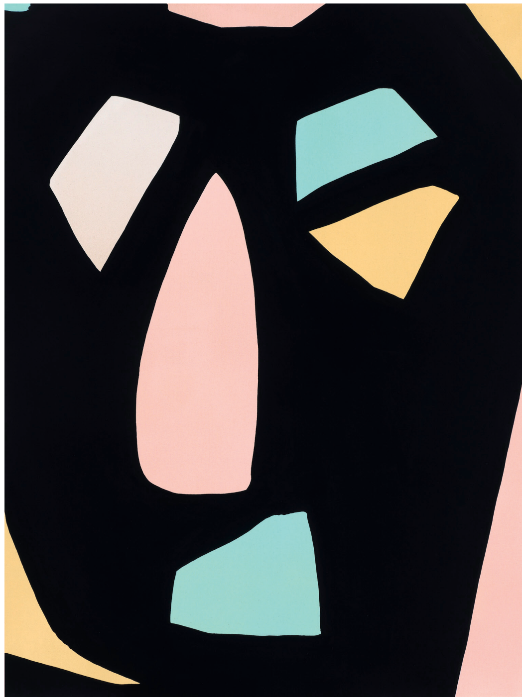
Cornelia Baltes Moi, 2021 Acrylic on canvas 120 x 90 cm