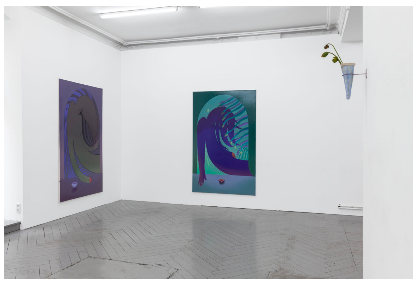
Exhibition view, Igor Hosnedl, 2019

Hundred liters of diet ink March 1 - April 6, 2019