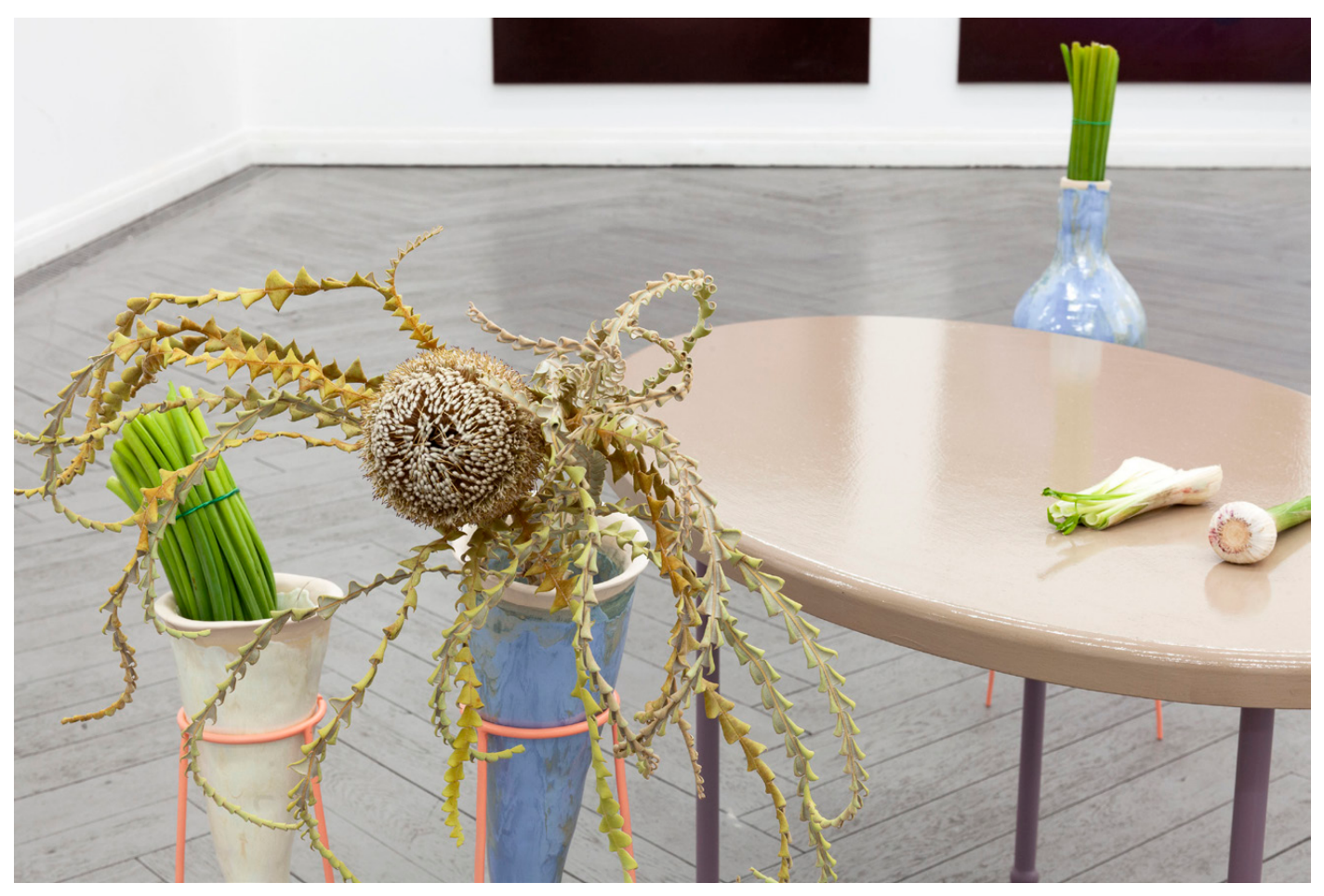
Exhibition view, Igor Hosnedl, 2019