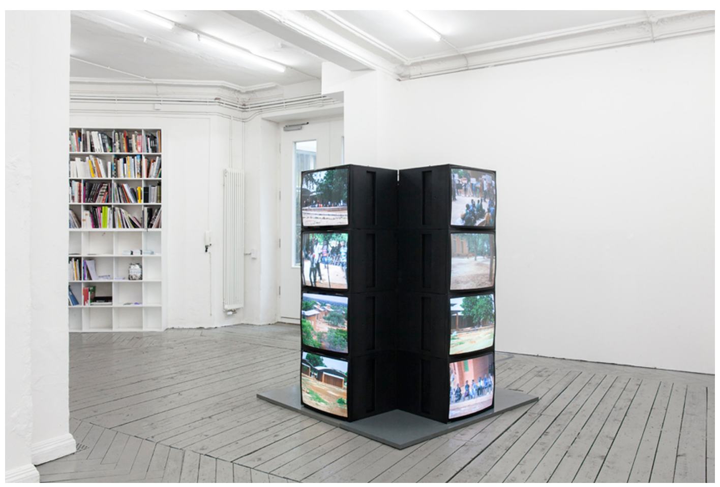
Exhibition view, Laafi Bala, 2017

The Operndorf Afrika is an international art project that was founded in 2009 in Burkina Faso / West Africa that is based on the ideas of German artist Christoph Schlingensief (1960-2010). Schlingensief's goal with the project was to create an international meeting place, in which people from different backgrounds could work together artistically, and exchange ideas about art. The exchange is part of the everyday reality of a newly emerging village, about 30 km from Ouagadougou, the capital of Burkina Faso. To this day, 23 buildings have been erected on the site provided by the Burkinian government, including a primary school, a hospital, and residential buildings. All building projects, cultural projects and their financing are coordinated by the Festspielhaus Afrika gemeinnützige GmbH founded in 2009 by Schlingensief, based in Berlin. In 2015, the first international Artist-in-Residence program in West Africa was held in Operndorf Afrika. Different artists of varying mediums are invited and encouraged to use the space for several weeks as both a living and working space. Operndorf Afrika is understood as a platform where different forms of dialogues and encounters can arise from the dualistic transfer system and be reconciled in it's inconsistency. Art is to be understood as the direct language of the debate and help to arrive at differentiation, to reconsider the