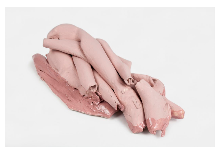
Laura im BBK 2, 2017, ceramic, glazed with Laura Pankau, 17,5 x 64 x 25 cm