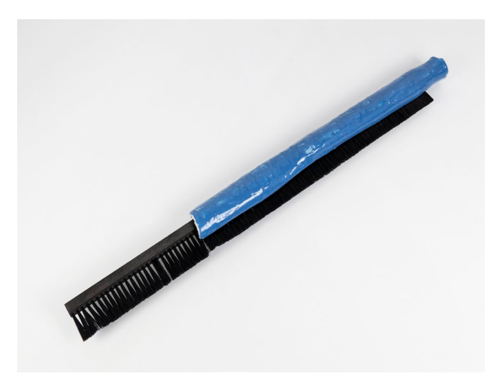
Blauer Besen, 2017, glazed ceramic, brush, 7,5 x 106,5 x 10 cm