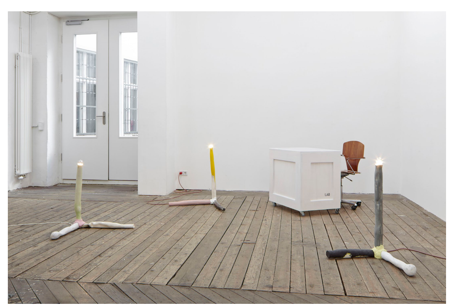
Exhibition view, Die Putze, 2017