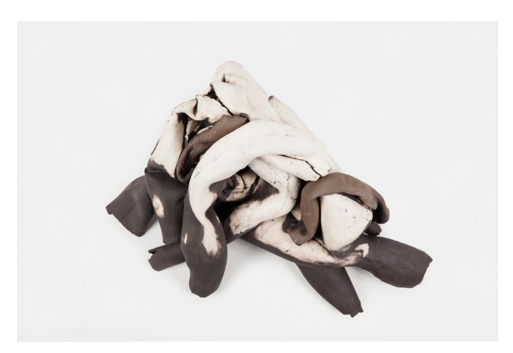
die Putze, 2017, ceramic, glazed together with Laura Pankau, 36,5 x 66 x 60 cm