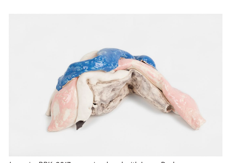
Laura im BBK, 2017, ceramic, glazed with Laura Pankau, 18 x 41 x 27 cm