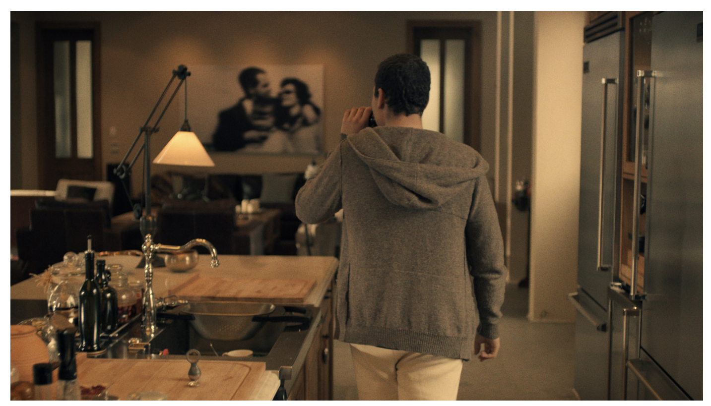
Assaf Gruber, Citizen in the Making, 2015, video, 6:38 min, edition 5