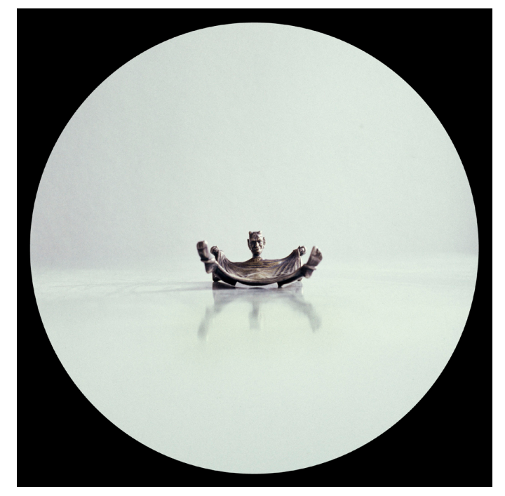
Assaf Gruber, Laundry Room Inside of a Clinic, 2015, c-print, 70 x 70 cm

Gruber's works in video and sculpture are characterized by a bodily presence in their materiality and objecthood. Masterfully orchestrated, his works resemble landscapes of thought encompassing instability and balance in relation to the the unconscious grammar of human behaviour. His new body of work is a direct continuity to his eclectic investigation of the relationship between moving images and objects, repetition and montage.